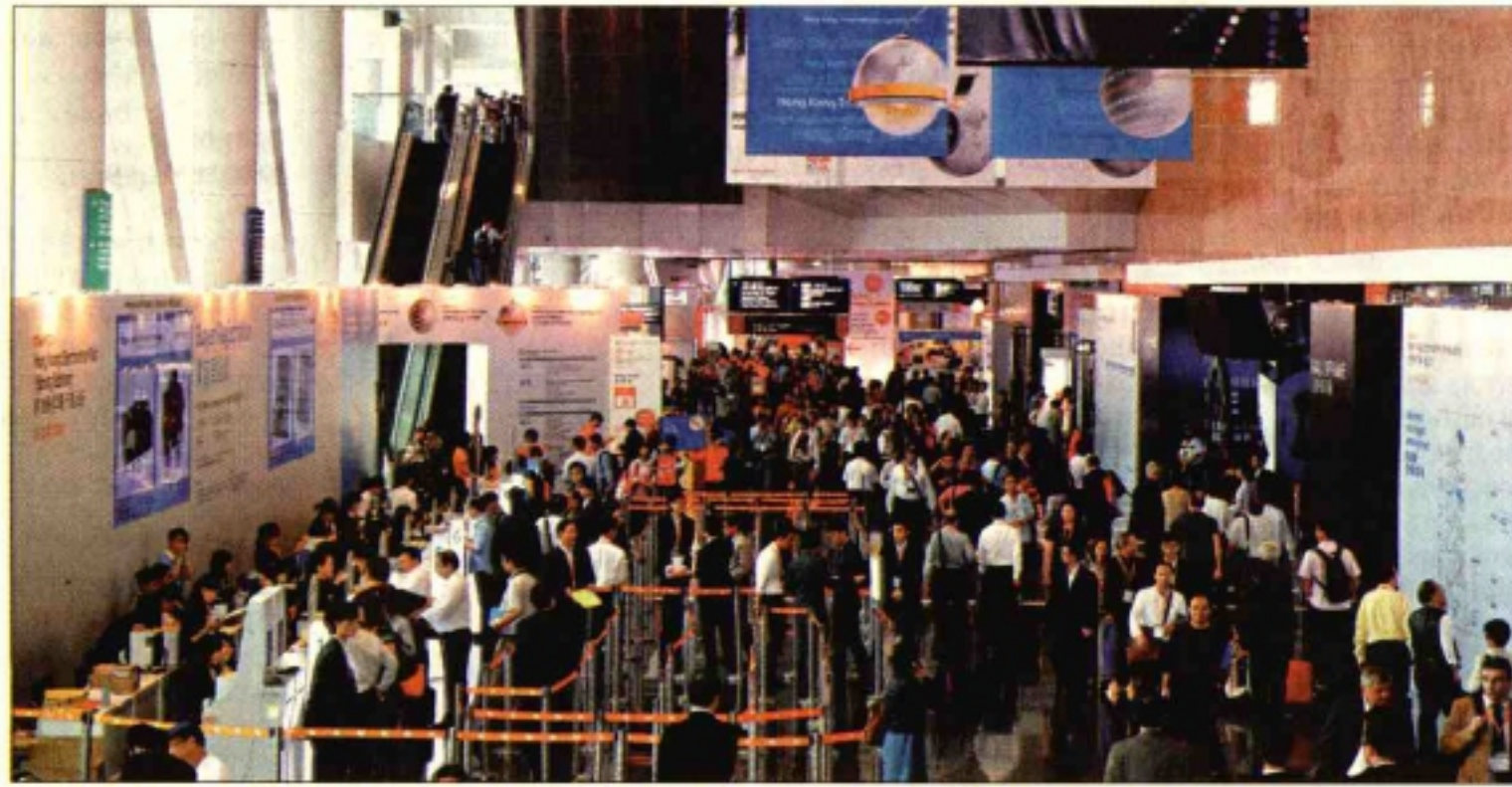
The Hong Kong Trade Development Council is hosting electronics, ICT and lighting fairs at the same time.

Advanced Materials Enterprises (AME) is looking forward to showing its award-winning and novel heating technology, Nanoheat, and related products. "The Hong Kong Electronics Fair, as a platform to