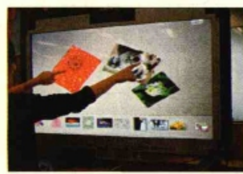
ASTRI's Optical Multi-Touch Panel

"Through the expo, we wish to let the industry have a better understanding of our company and to showcase our latest developed technologies," says the institute's Dr